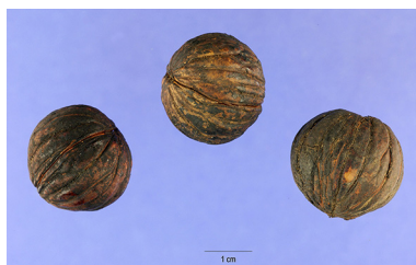
Black Walnut seed

Direct seeding allows for more normal root development, avoids seedling transplant shock, and may increase the quality of trees that are eventually developed.