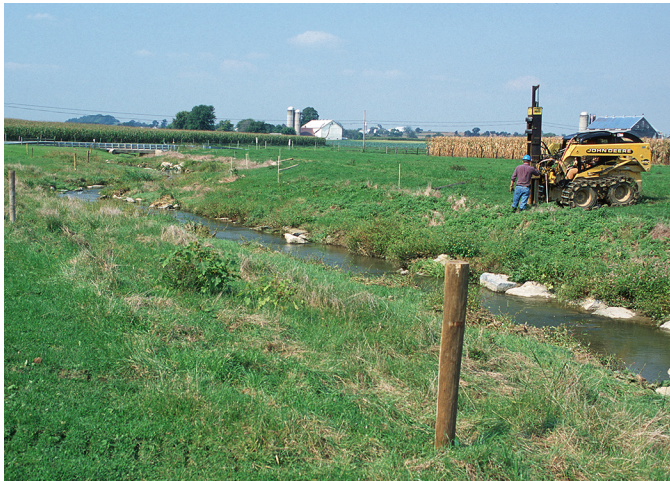
Riparian Corridor being fenced and restored