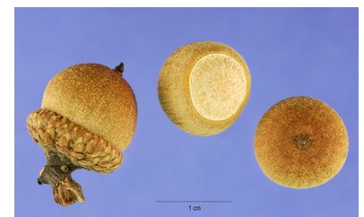
Red Oak seed