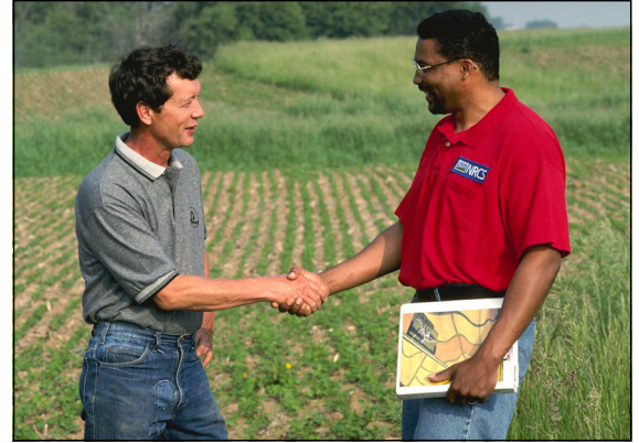
Helping People Help the Land

You may also be eligible to receive financial assistance, through a state or federal program. Your NRCS office will explain any programs that are available so you can make the best decision for your operation. All NRCS programs and services are voluntary.